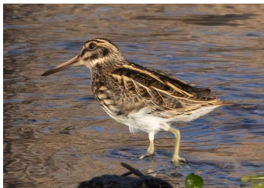
Jack Snipe, Thacka Beck, 6 December 2023.