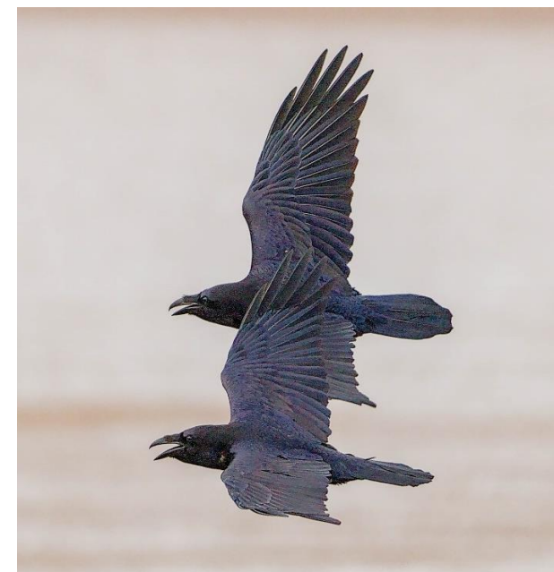
Ravens, Askam, 4 November 2023.