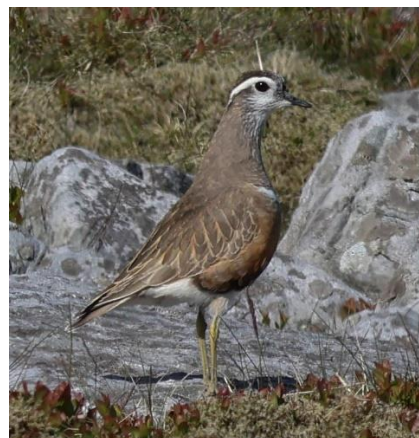
Dotterel, North Pennines, 2 June 2023.

Cumbria is a big county, with birdwatching sites ranging from estuaries and sea-cliffs, through lakes and reedbeds to oak woodland and open fell tops.