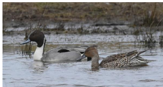
Pintail, Campfield Scrapes, 25 February 2023.