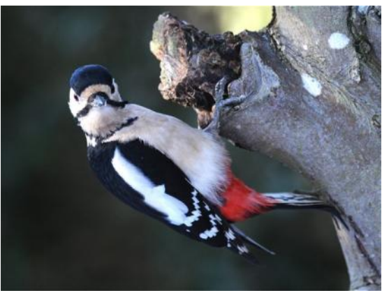
Great Spotted Woodpecker, Stanwix, Roger Ridley

island on it, and a wildlife pond on the track down to the left through the visitor reception. Firstly, the formal pond and its grassy surround offers a good loafing and feeding area for Cormorant, Grey Heron, two or three Mute Swans, Mallard, Tufted Duck and Kingfisher in winter. A pair of Little Grebe have bred for the past few years with success.