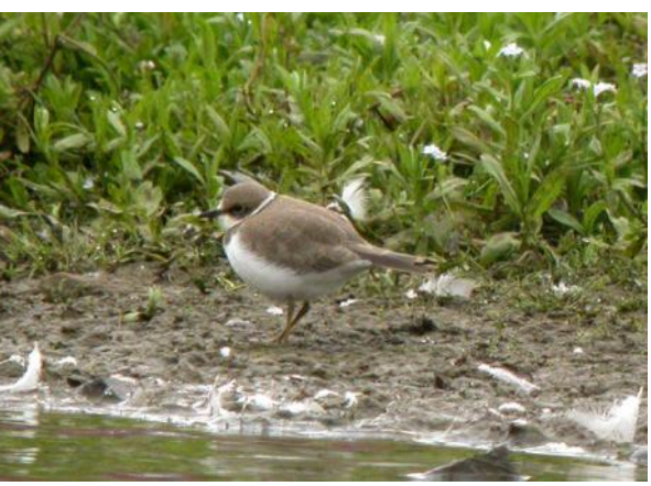
Little Ringed Plover, Soddy Gap, Craig Shaw

The list of species covered by RBBP has grown as the advantages of an annual status check for rarer species have been increasingly recognised. The number has ranged from just 42 very rare species in 1973 to almost 200 now, although only 76 are currently classified "regular" breeders. i.e. those for which there is at least one breeding attempt in most recent years. The criteria for inclusion have