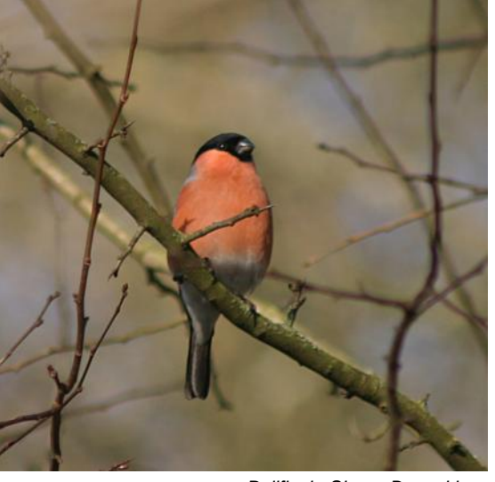
Bullfinch, Shaun Donockley

In September 2011 I installed a bird feeding area into what was a dog toilet next to the car park. This is now in full swing with up to 30 birds at a time feeding within the fenced off enclosure. Piles of wood/brash