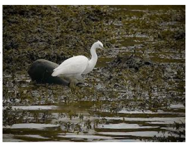
Little Egret, Port Carlisle, Craig Shaw

Whinfell Tarn hosted a female Mandarin in August. A Scaup at Hodbarrow on 29th June was part of an influx of avthya ducks. Common Scoters at coastal sites included 440 at Walney and 300 off Nethertown while a drake inland at Killington on 12th July was followed by another four birds at the same site plus singles at Longtown, Tarn House Tarn and Sunbiggin Tarn.