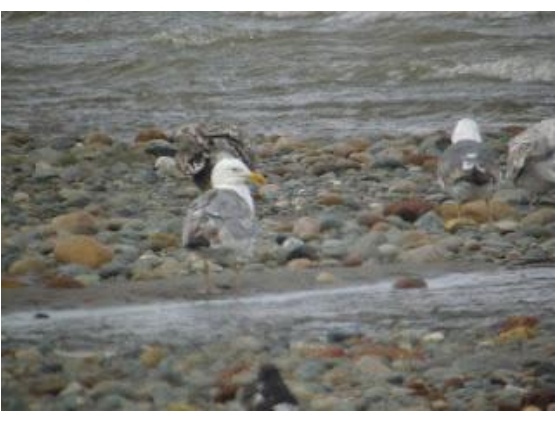
Yellow-legged Gull, Allonby, Craig Shaw

a juvenile that briefly visited Sellafield on 29th August. August produced a minor influx of Black Terns with two off Workington on 26th and singles at Walney on 28th and near Fingland on 31st. Away from St Bees Head, Puffins consisted of three at Workington and singles at Walney in June and July while single Black Guillemots were seen at Workington, Nethertown and Walney.