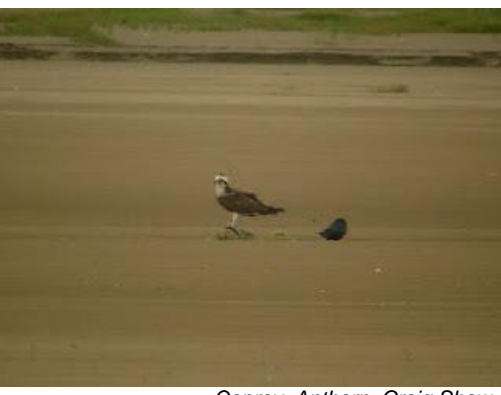
Osprey, Anthorn

Away from the vicinity of Grizedale Forest where the final batch of 30 young birds was released in August, Red Kites were seen at Holme Dub, Watchtree N.R. and Thacka, Penrith. An unseasonable male Hen Harrier on the Inner Solway on 26th June was followed by a ringtail near Beckermet on 31st July. At least two different Marsh Harriers were seen regularly near Arnside throughout the