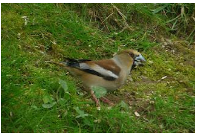
Hawfinch, Sizergh

The spring and summer of 2011 saw the final year of the third national breeding bird atlas project. Some readers may have been active in the very first such atlas, which surveyed all the 10km squares of Britain and Ireland in the five years 1968-72. It was out of this first atlas that the Rare Breeding Birds Panel (RBBP) was born.